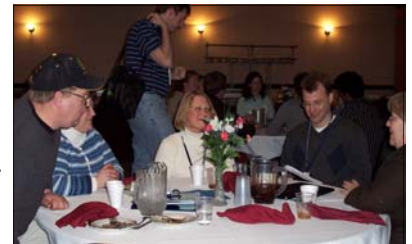
Attendees enjoying lunch and conversation at the Spring HFH of NYS Conference. Read more about it inside!